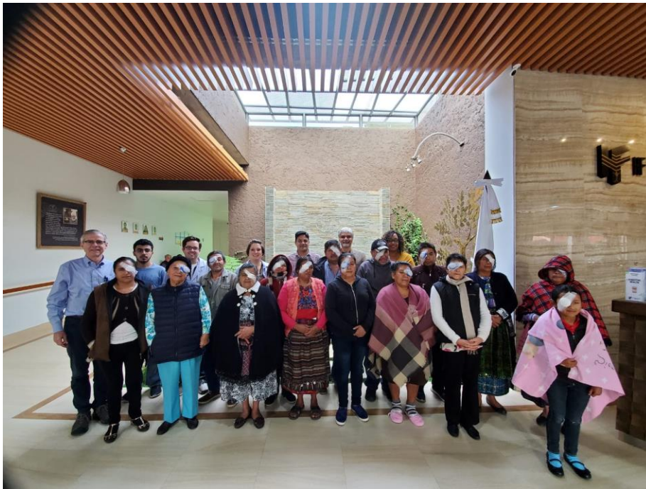
Photo 5: Group of post-operative patients on last day of surgical camp. (Photo taken with patient permission)

Dr. Bouchard worked around the clock performing ocular surface surgery as well as meeting with local officials to discuss ways to improve access to high quality, cost-effective and sustainable eye care.